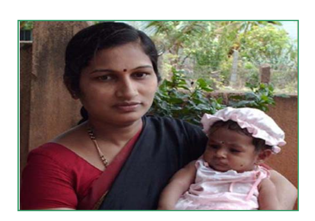
FACT SHEET GOA