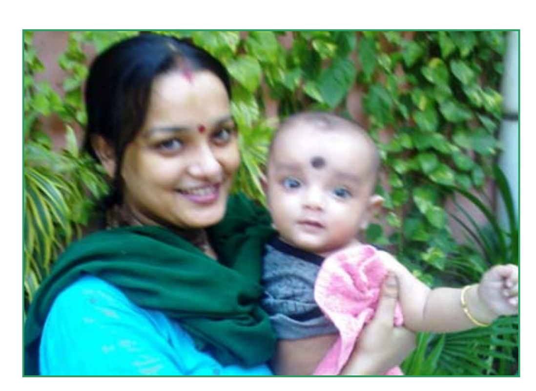
FACT SHEET DELHI